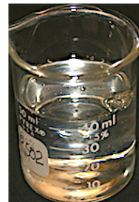
R-502 high temperature penetrant remover